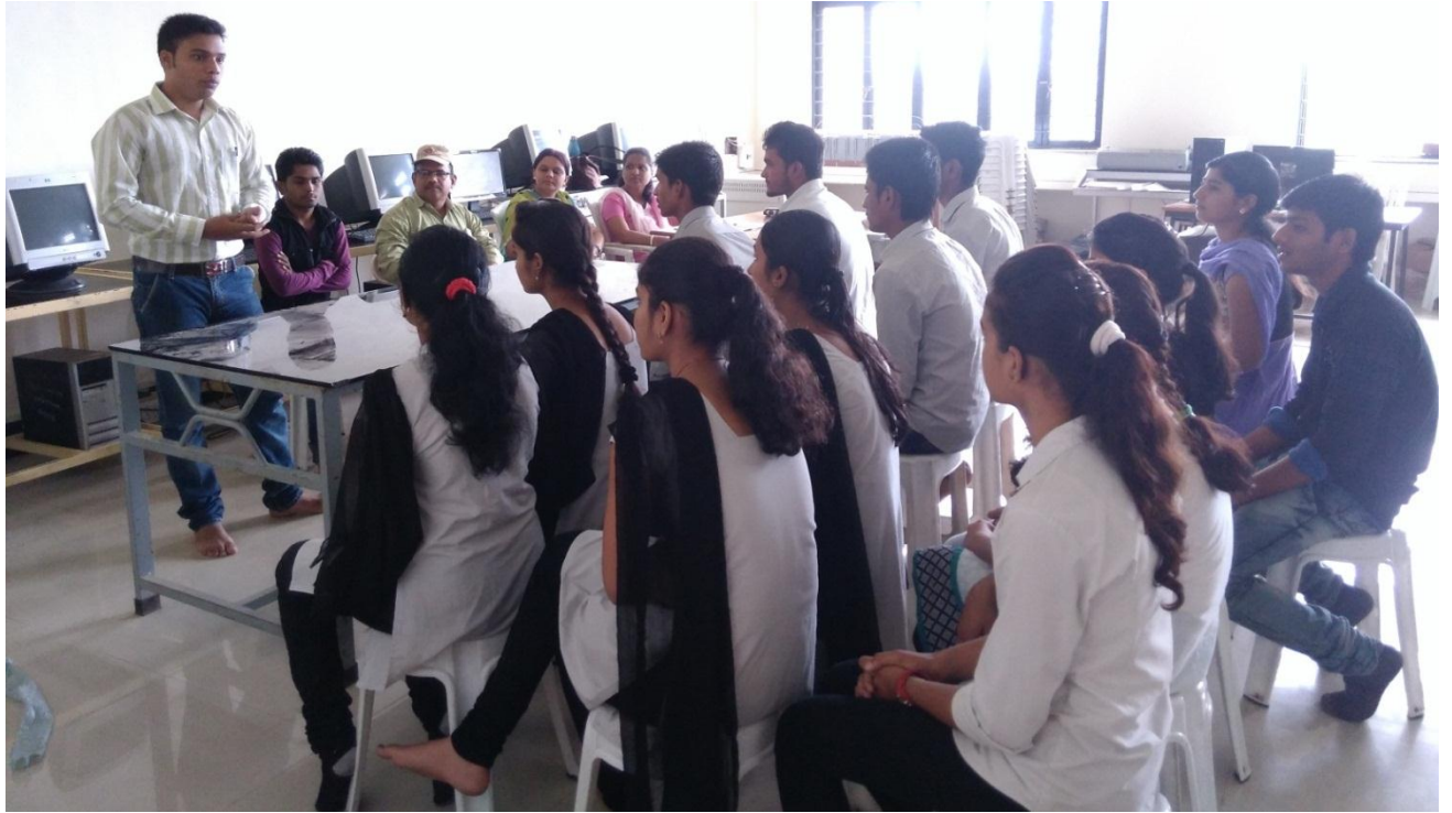
Alumni guiding to the TYCO students.