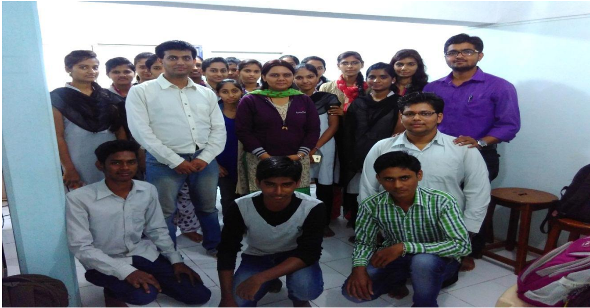
Visit to CPAG, Graphology Expert, Nashik