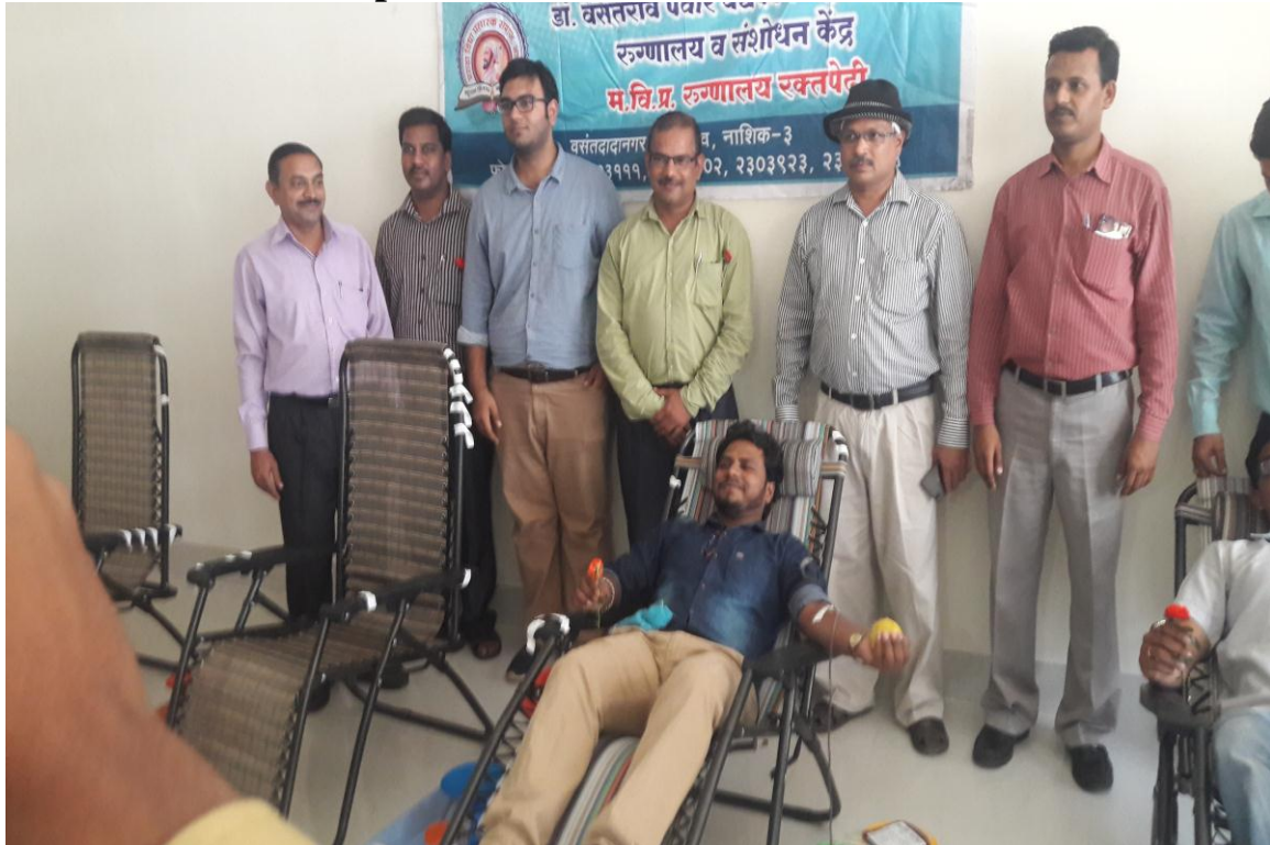
Blood Donation camp at Chandori

A blood donation camp was organised by the K K Wagh Polytechnic Chandori at campus on 16 th July 2016. The blood donation drive was organised in collaboration with the Vasanttrao Pawar Medical College, Nashik. More than 25 volunteers from among the students, faculty and staff members participated voluntarily in the camp. The camp helped the students gain awareness about Blood donation and a service to the society.