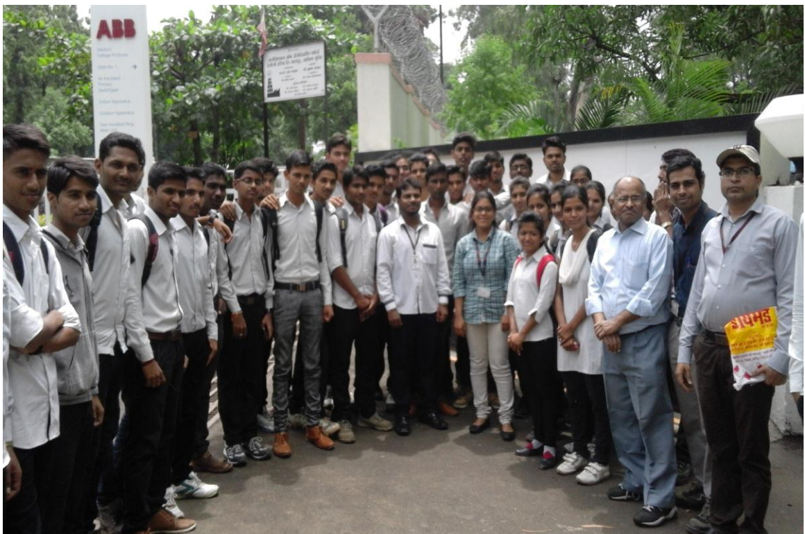
Study visit in ABB on 21 st July -2016.