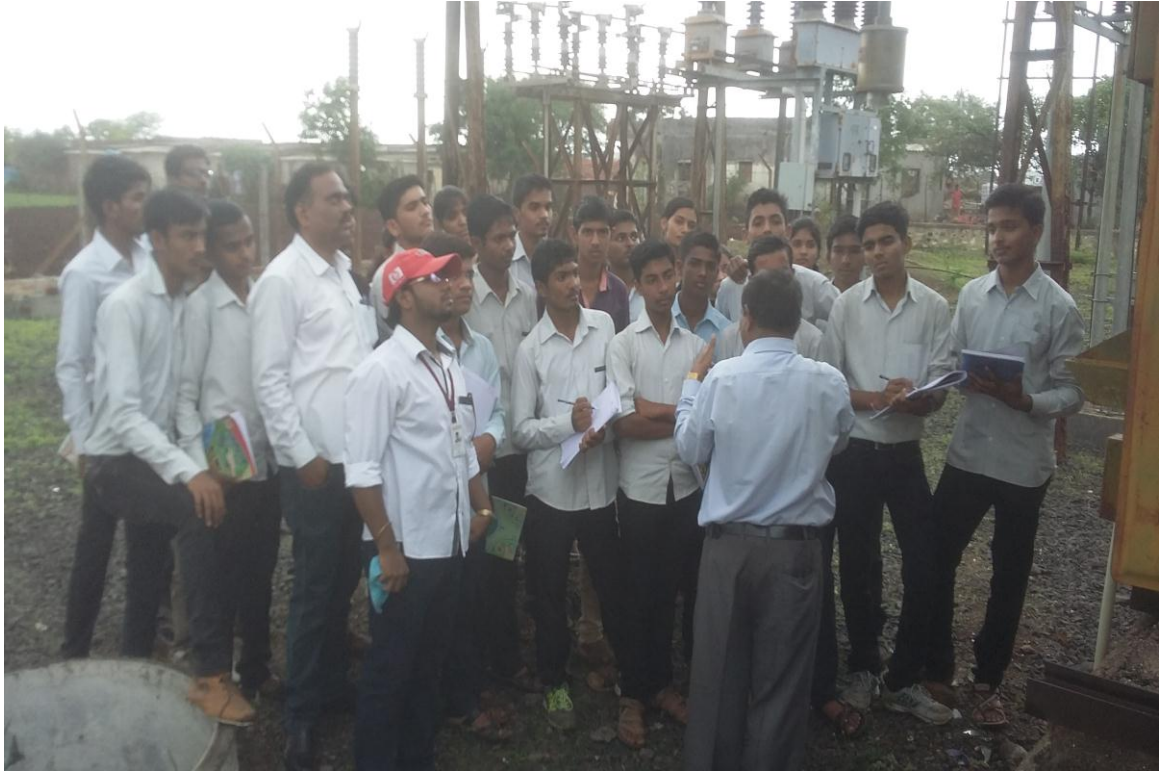
Pimplas Substation visit on 18 th July -2016.

Electrical Engineering department organized Substation visit on 18 th July-16 for study 33 KV Substation in Pimplas Student came to know about Electrical power Generation Transmission & Distribution in Substation.