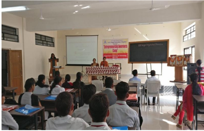
Inauguration ceremony of workshop

Experiences in SSI, Experiences in SSI & Virtual Marketing Tools, etc. The workshop was successfully conducted and it found to be very useful for the participants.