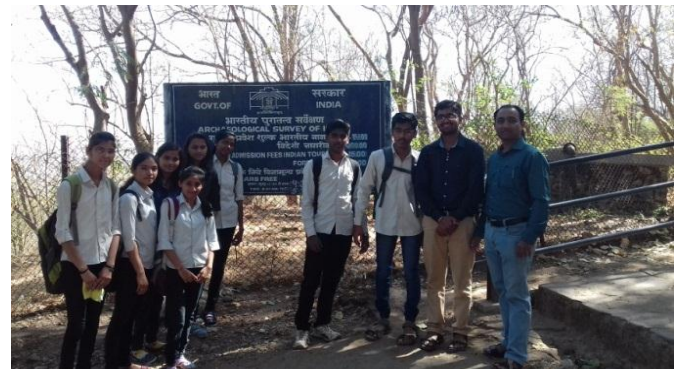
Environmental Study Visit at Pandav Leni & Phalke Smarak