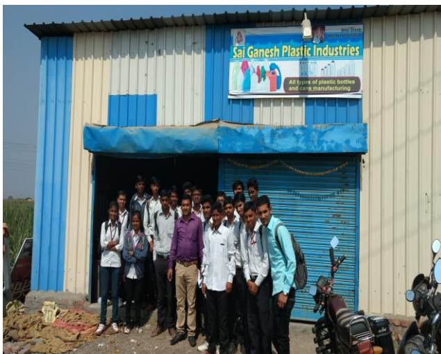
Visit to Sai ganesh Blowing Enerprises, chandori