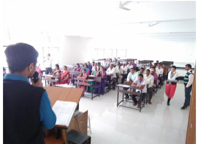
Parents gathered for Meeting