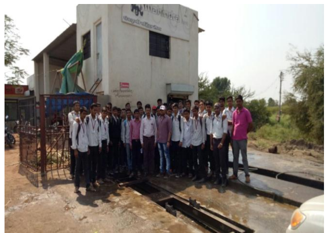
Visit to Panchkrishna Service Station, Chandori