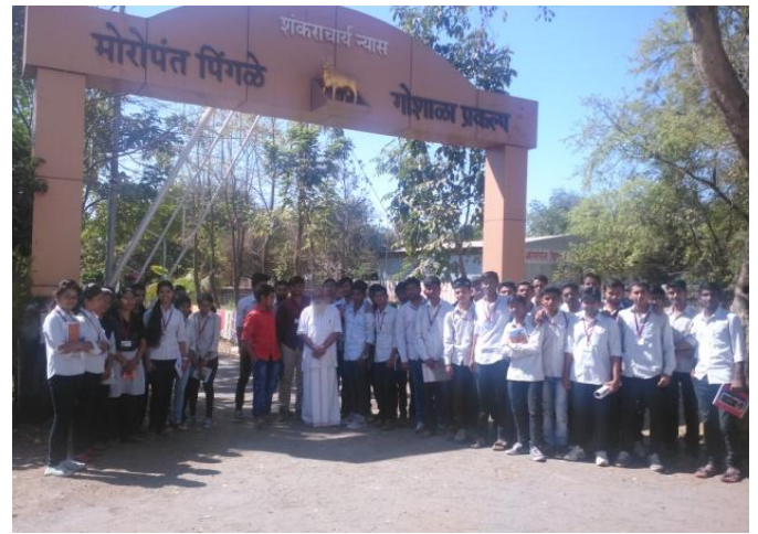
Visit of TYCE students at Vermi composting,Gangapur Road