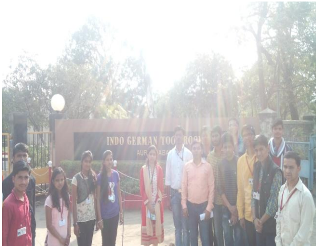
Visit to IGTR, Aurangabad